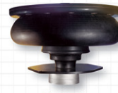
Air Spring Assembly